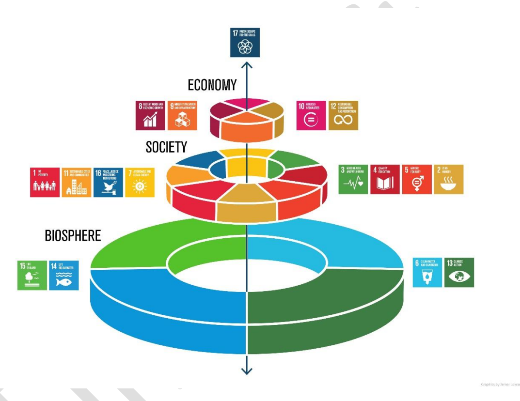
Figure 1: Illustration of the 17 Sustainable Development Goals across the three spheres of sustainable development: biosphere, society and economy. Credit: Azote Images for Stockholm Resilience Centre.

At the United Nations (UN) General Assembly in September 2015, Heads of States and Governments agreed on 17 Sustainable Development Goals (SDGs) as framework for the 2030 Agenda for Sustainable Development. The SDGs integrate the three dimensions of sustainable development (biosphere, society and economy, as illustrated in Figure 1) and aim to foster action for people, planet, prosperity, peace and partnership. For each high level goal, a number of specific targets have been agreed by the countries. (Further details on the individual SDGs and targets can be found at https://sustainabledevelopment.un.org/sdgs).